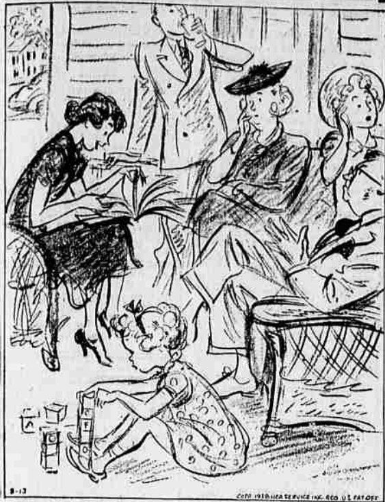
"She says so many cute things I have to write them down or I'd forget half of them."