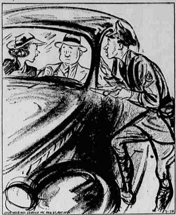
"Now, please, lady, it wasn't altogether his fault."