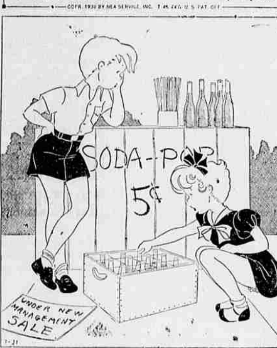
"Our under-new-management sale didn't get rid of much of this lime pop. How about a lease-expires-positively-must-vacate sale tomorrow?"