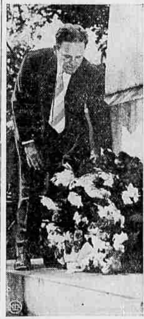
This picture might not be at all unusual—except that it shows the chairman of the Republican National Committee honoring the founder of the Democratic party, John D. M. Hamilton in a picture placing a wreath on the tomb of Thomas Jefferson at Monticello, Va.