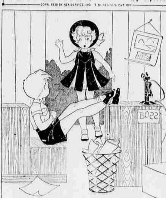
"I want a complete rest, so I'm not leaving any forwarding address. But if things get in a jam, just stick your head over the fence and yell for me."