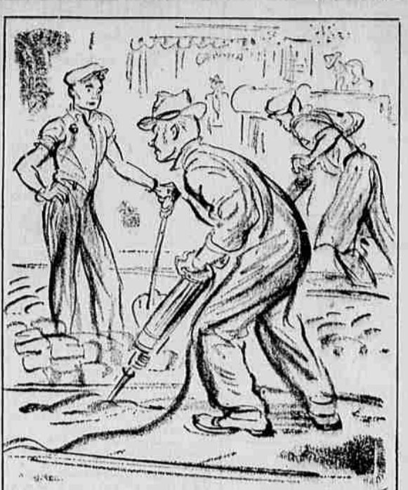
"I used to have a good white-collar job, but when the kids came along we needed more money."