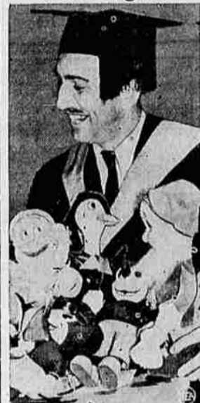
Father of Mickey Mouse, Donald Duck and the Seven Dwarfs, Walter Elias Disney, genius of the animated cartoon, who never went to college, was recently honored for his work by America's two foremost places of learning, Yale and Harvard. Photo shows him, fresh from his Yale tribute, in cap and gown at Harvard where he was given the honorary degree of Master of Arts. A few of his brain-children are in his lap.