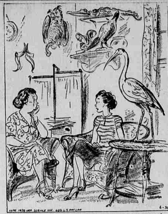
"The woman who rented this place to us made us promise we'd leave everything where it is."