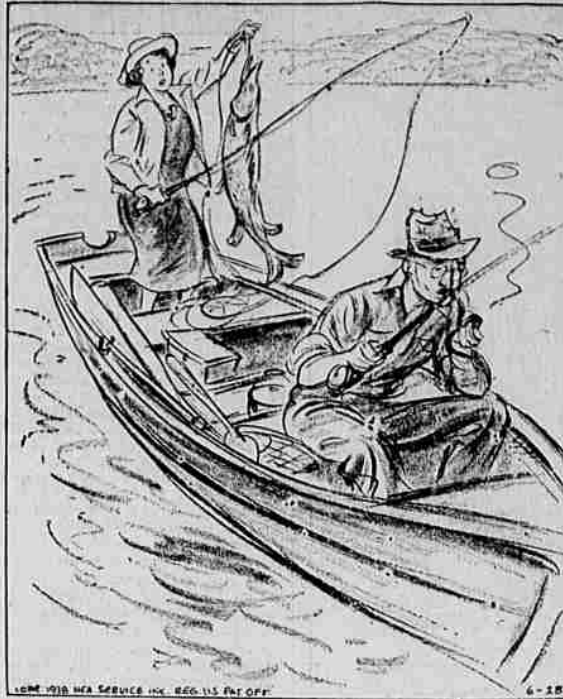
"Please look, Henry—have I caught something here?"