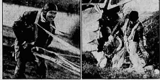
Scenes from "Test Pilot," which comes to Hunt's Indian theater Thursday for a three-day engagement. The cast includes Clark Gable, Spencer Tracy, Myrna Loy and Lionel Barrymore as stars, and a long list of high ranking players in the splendid supporting cast.