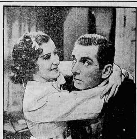
Gracie Allen and Edw. Everett Horton in a scene from "College Swing," which opens at the Indian Thursday for a three-day showing. The cast includes Jackie Coogan, Betty Grable, Martha Raye, Ben Blue and George Burns.