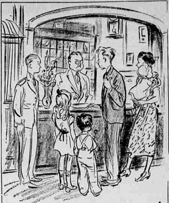
"How much for a room just to take a bath? We've got our trailer parked out in front."