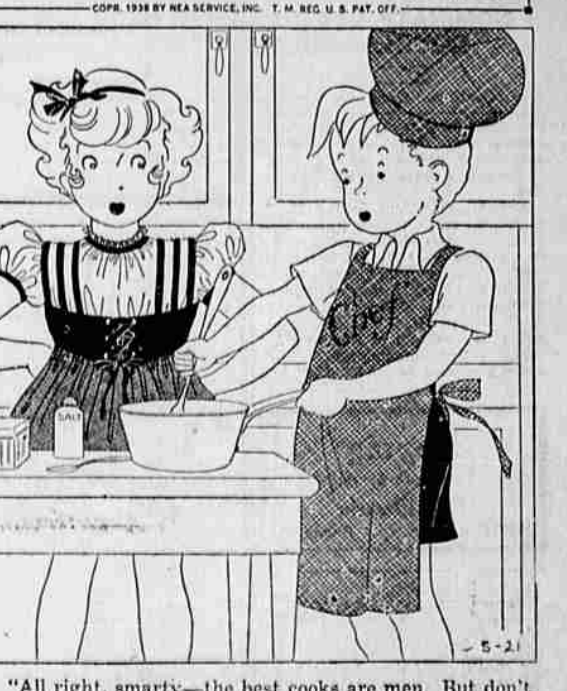
"All right, smarty—the best cooks are men. But don't ask me to eat any biscuits like father used to make"