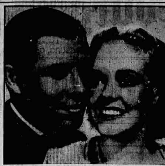
George Murphy and Alice Faye, in the lead roles of "You're a Sweetheart," at the Indian theater Sunday, Monday and Tuesday.