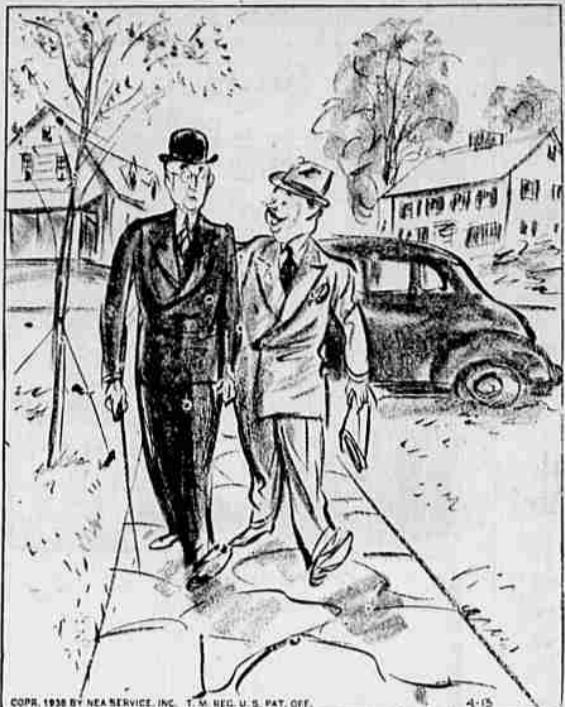
"Now if my wife acts huffy because you blow in with me, we'll just pay no attention."