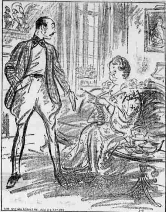
"Why, Auntie, you'd think I was asking for a million dollars, when all I need is a coupl'a hundred thousand."