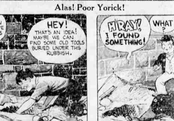
HEY! THAT'S AN IDEA! MAYBE WE CAN FIND SOME OLD TOOLS BURIED UNDER THIS RUBBISH.