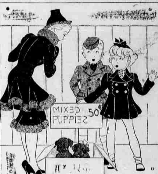
"Would you care to place an order? All we have left are scottie-poodles and scottie-dachunds."