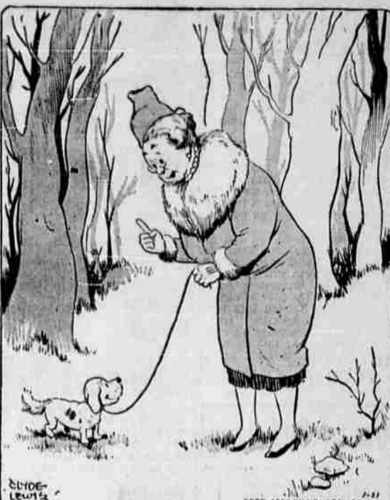
"I'll let you off the leash—but, mind you, no fox hunting!"