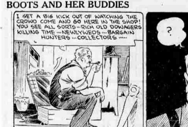
I GET A BIG KICK OUT OF WATCHING THE CROWD COME AND GO HERE IN THE SHOP! YOU SEE ALL SORTS—RICH OLD DOWAGERS KILLING TIME—NEWLYWEDS—BARGAIN HUNTERS—COLLECTORS—