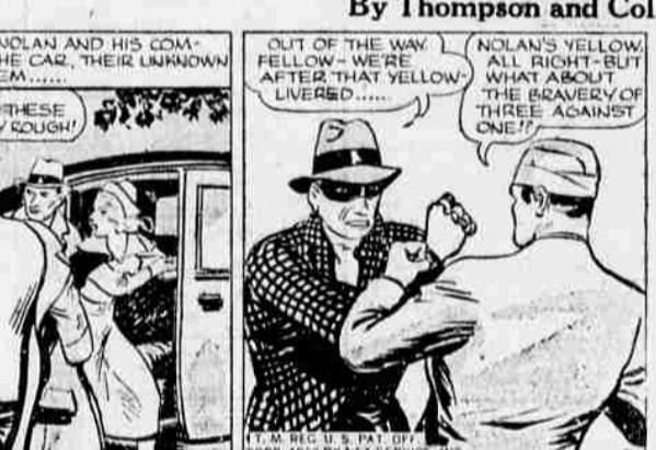
OUT OF THE WAY, FELLOW—WE'RE AFTER THAT YELLOW LIVERED...