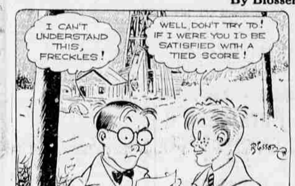
I CAN'T UNDERSTAND THIS, FRECKLES!