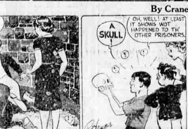
OH, WELL! AT LEAST IT SHOWS WOT HAPPENED TO TH' OTHER PRISONERS.