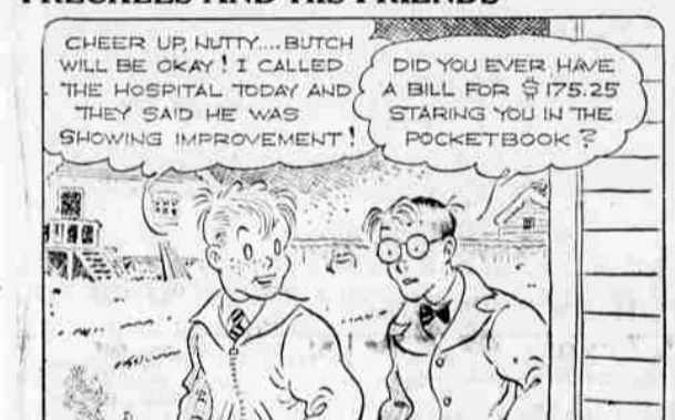
CHEER UP, BUTCH... BUTCH WILL BE OKAY! I CALLED THE HOSPITAL TODAY AND THEY SAID HE WAS SHOWING IMPROVEMENT!