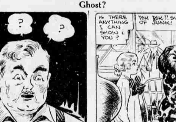
IS THERE ANYTHING I CAN SHOW YOU?