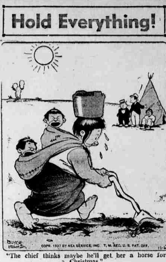
"The chief thinks maybe he'll get her a horse for Christmas."

Director Hoover Reveals $7 Saved Taxpayers for Every Dollar Spent. NEW YORK, Dec. 6.—(AP)—J. Edgar Hoover, director of the federal bureau of investigation announced "dividends" to U. S. taxpayers of $7 for every dollar spent on the bureau.