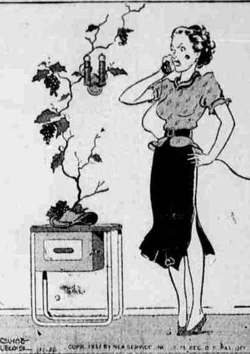
"Modiste Hat Shop? One of your hats is sprouting!"