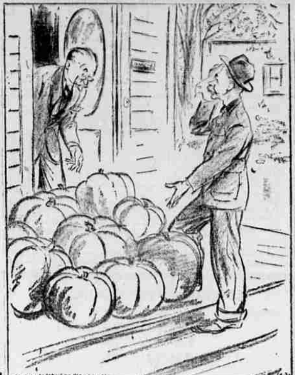
"Well, doctor, I guess that about settles my bill with you, doesn't it?"