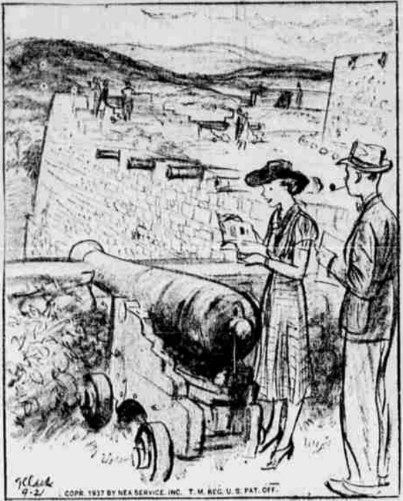
"Oh, I remember reading about this fort in history class. I didn't know it was real."