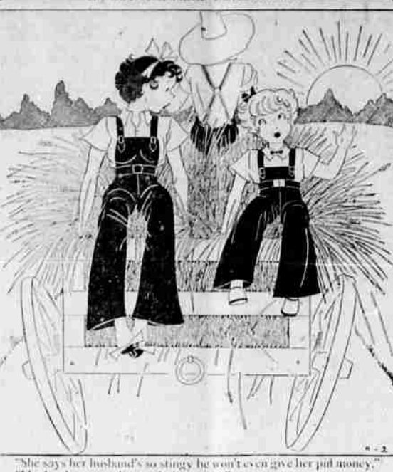
"She says her husband's so stingy he won't even give her put money." "Maybe she wants diamond pin money."