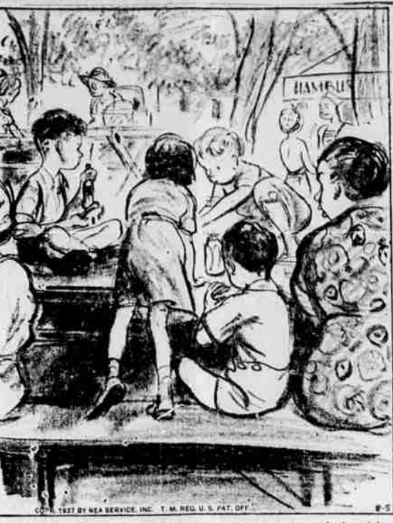
"Junior! Don't go stepping in the potato salad with those new expensive shoes of yours!"