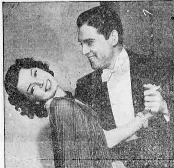
Frances Langford and Phil Regan, who lead an impressive cast in "The Hit Parade," which opens Thursday at Hunt's Indian theatre. Other big names in the cast include "Molasses and January," Al Pierce and His Gang, Duke Ellington and his band, Eddie Duchin and orchestra.