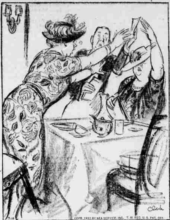
"Don't let her pay that check, waiter! She bought the tickets for the etiquet lecture."