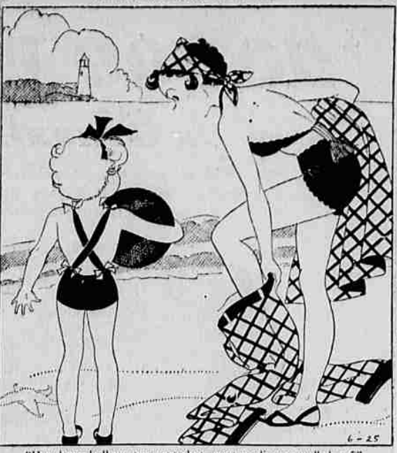
"How long shall we stay out today—rare, medium or well-done?"