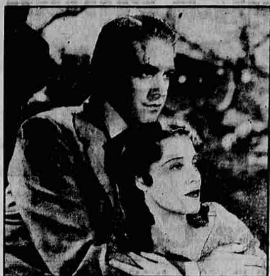
Nelson Eddy and Jeanette MacDonald in "Maytime" Jeanette MacDonald and Nelson Eddy reach the zenith of their dazzling co-starring career in "Maytime," Rida Johnson Young's heart-stirring story of an opera star who gave up romance for a career. You will never forget their duet of the everlasting melody, "Sweetheart, Will You Remember?" in the lavish new M-G-M musical hit, coping Sunday to Hunt's Indian for a three-day engagement.