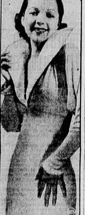
Frances Langford, who smiles at you so charmingly here, ranks above Marlene Dietrich, Lily Pons, Ginger Rogers and several thousand other young women in having the "most perfect figure in the theatrical world," feminine professors of a New York manniquin school decided. Frances also has personality, poise and charm they added.