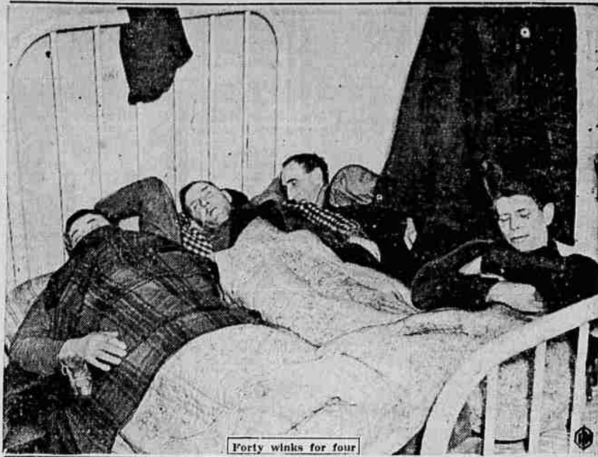
Forty winks for four

Demanding higher wages, an 8-hour day and better living conditions in their logging camps, including shower baths, more than 3,000 lumberjacks in northern Minnesota went on strike, threatening to paralyze the largest industry in the northwest.