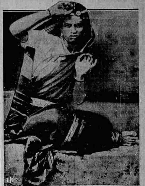
Seemingly frightened by the camera which she had never seen before, this woman of Punjab, India, who gave birth to sextuplets, five of whom are living, poses in her best clothes and jewels.