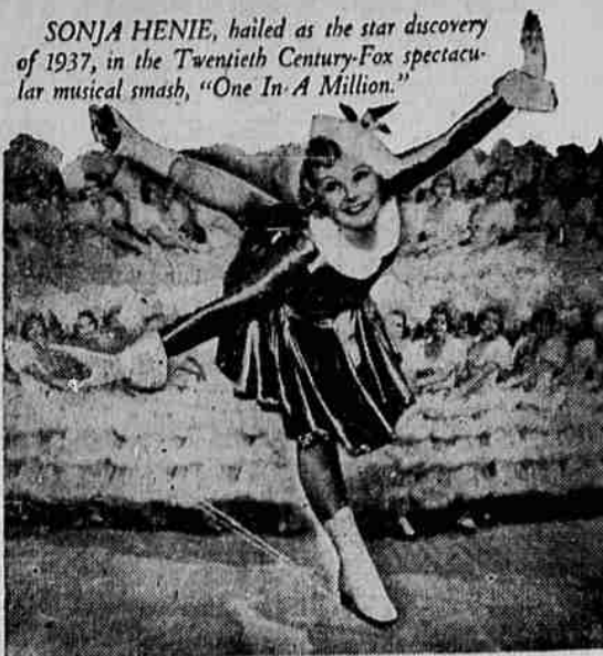
SONJA HENIE, hailed as the star discovery of 1937, in the Twentieth Century-Fox spectacular musical smash, "One In A Million."