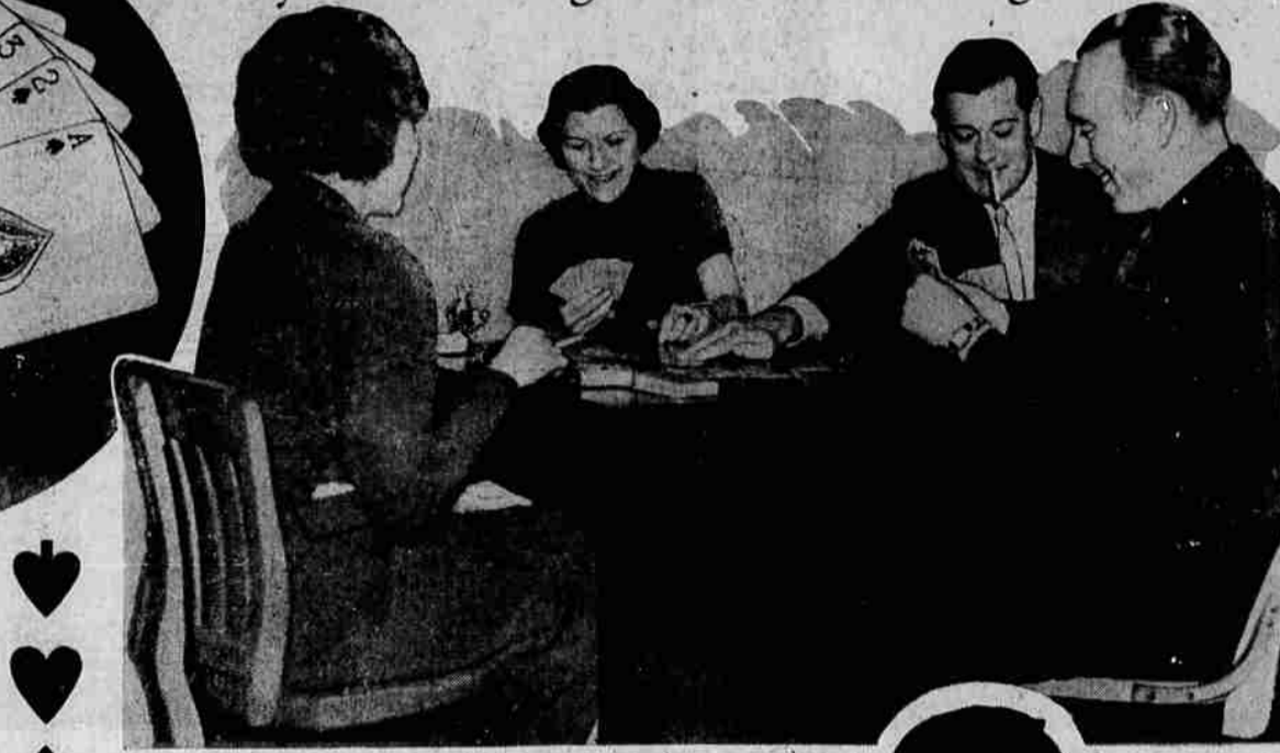
Even during the lunch hour will bridge fiends gamble away their lunch money in the office buildings of the nation. From such innocent diversions as this comes the hotel lobby hanger-on, hunting for a lamb to shear. "Big oaks from little acorns grow."

SCENE TWO, Beer Two—Mr. C laments the fact that they haven't a fourth to make up a game. (N.B. This statement is made just as the waiter is setting the glasses on the table.) The waiter, an obliging fellow, overhearing this remark apologetically suggests that several of the