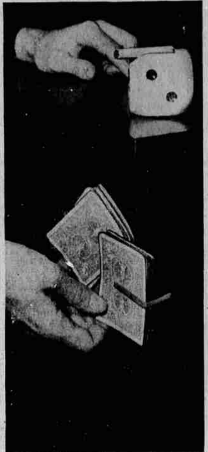
A very simple "guarantee" used by some bridge sharps to insure their being dealt hands like the one pictured on the opposite side of the page. This gadget is seldom used through fear of being "caught in the act."

If you are using a standard deck, supplied by most clubs and hotels, it is a simple matter for "the boys" to run in marked cards, or better yet, a "stripper deck." The things a card hustler can do with a stripper deck would amaze you. To prepare a stripper deck for bridge, the twenty honors, or ten, jack, queen, king, and ace of each suit are laid aside and the remaining cards are "stripped" or shaved a fraction of an inch narrower in width on one end. The cards are