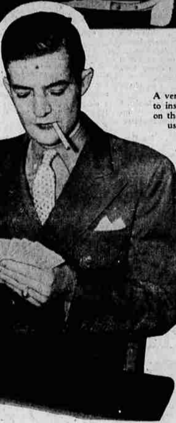
Even the position of the cigarette tells what aces are held, if any. Such tricks are hard for the ordinary player to discover, and more difficult to "nail" on the user.

If Mr. D should hold six spades, he will arrange his hand so that the first six cards are slightly elevated above the others. If his strong suit is hearts, the end cards will be elevated to a point indicating the number of trumps. Bridge is a gentleman's game and it is customary to employ two decks during the play.