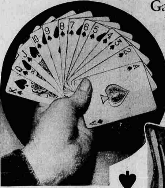
The perfect suit hand in bridge and one which is very seldom dealt fairly but quite often is "run in" to dupe unsuspecting victims.