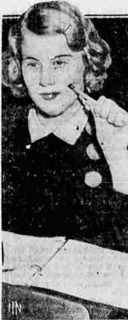
Marjorie Gestring, 13-year-old junior high school student in Los Angeles is the same Marjorie Gestring who won the springboard diving title at the Berlin Olympics. She's just a schoolgirl now.