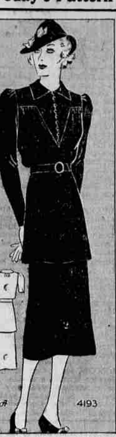
IT'S FUN TO "MAKE YOUR OWN" WITH THIS SMARTEST OF TUNIC PATTERNS. PATTERN 4193

by Anne Adams. You'll find it exciting to turn "home dressmaker" for a little while, when the result of your efforts is this up-to-the-minute tunic frock, Pattern 4193. Just think, with this simple pattern and a few yards of fabric in your favorite color, in no time at all you can turn out an engaging model that will be your standby all winter!