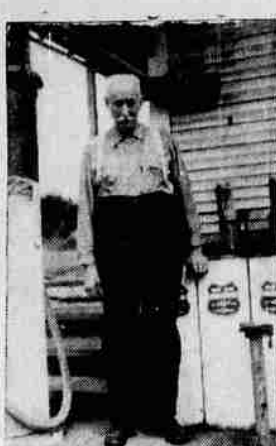
for and why. That's what it means to have lived in a community for many years, with a lively interest in one's neighbors and their welfare.