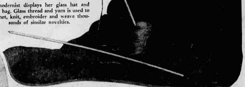
A modernist displays her glass hat and glass bag. Glass threads and yarn is used to crochet, knit, embroider and weave thousands of similar novelties.

ling and chic things for "mildady" are now being made of this glass thread.