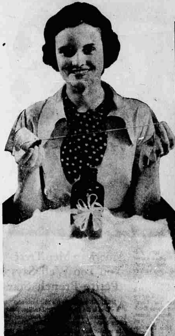
This girl holds a pack of fibrous glass as it is used for insulation for homes and buildings—keeps the rooms warm in winter, cool in summer.

Secret Process Has Developed A New Product--Fibrous Glass