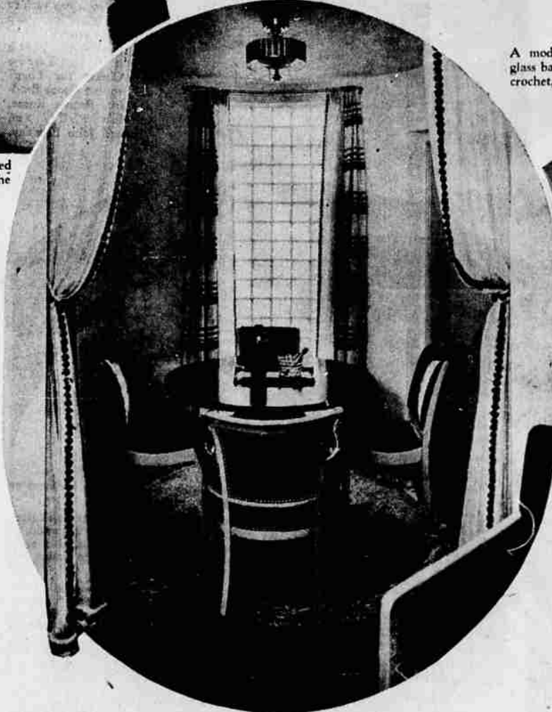
This dinette is an example of the modern trend made possible by the use of glass blocks as an exterior panel or wall. The panel transmits daylight and provides seclusion from street noise.

material about one yard wide and four inches deep. It is cut to size by an automatic slicer into packs which later are placed between walls and on floors in attics of new homes, forming an enveloping blanket of protective material that is fire, termite, and moisture proof.