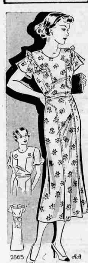
SOFTLY STYLED — DEMURELY RUFFLED THIS FROCK IS FOR WARM DAYS