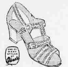
Hollywood SANDALS 1.19 A crocheted fabric that looks crocheted. MI white with blue trim. 2-5.