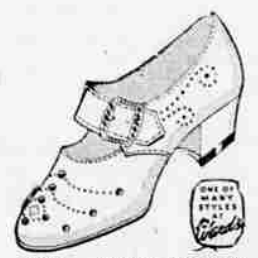
White WIDE STRAP 1.69 Smart with tailored things. Dainty perforated trimming. EN-finish leather. Sizes 3-8.