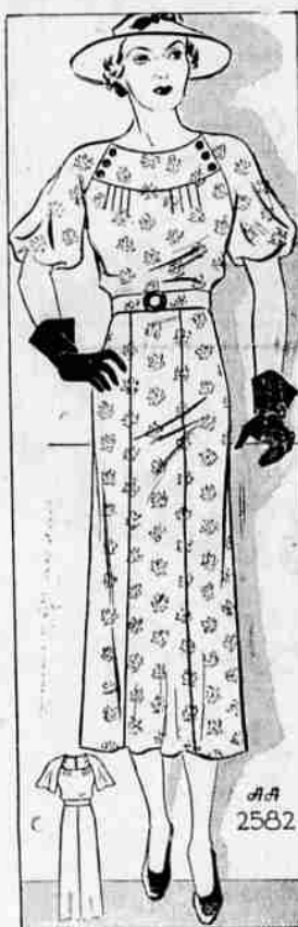
LOVELY! A FLATTERING WARM-WEATHER FROCK PATTERN 2582