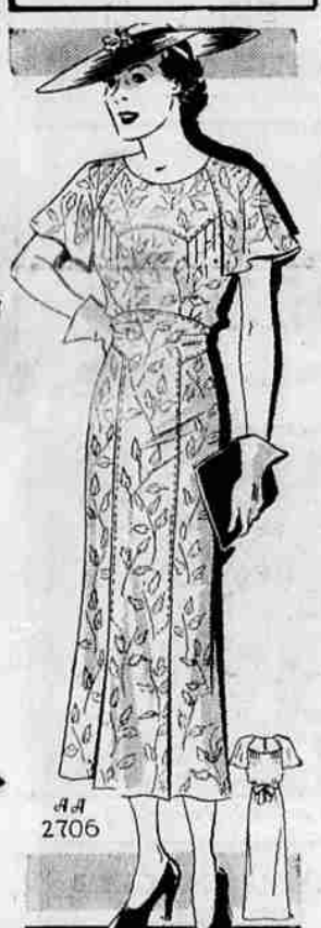
Sound A Color Note in Flattering Afternoon Style PATTERN 2706