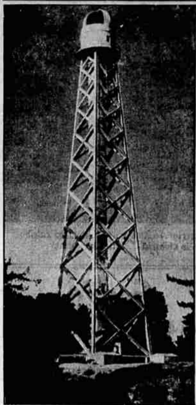
Constant observation of the sun is made from this 185-foot tower located at the Mount Wilson Observatory