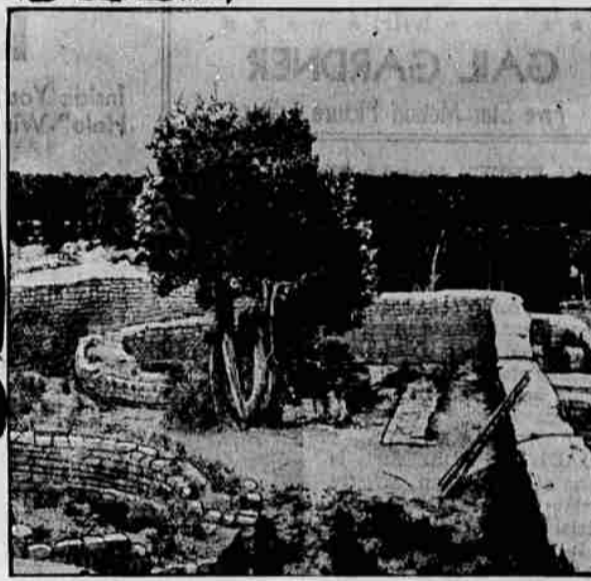
Here are shown the ruins of a sun temple, used centuries ago by a race of sun worshippers. It is in the Mesa Verde National Park

"If you ask why sunspots should have anything to do with volcanoes, the answer is that nobody knows. Times of maximum sunspots affect radio reception on earth, magnetism on earth and aurorae in the Arctic regions. Sunspots are accompanied by gigantic eruptions of gas on the sun and colossal electrical phenomena in the whole solar system. If earth magnetism and electricity are in some way associated with gravity, volcanism may be affected."