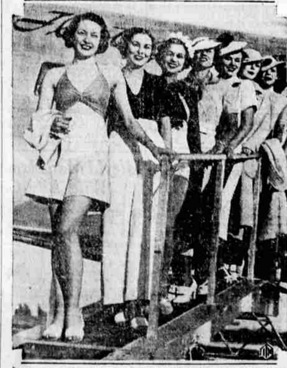
Bathing suits, sports wear and more formal attire worn at winter resorts this season reflect a decided streamlined influence as demonstrated by the styles worn by this group of comely models at a serial fashion show at Miami, Fla.