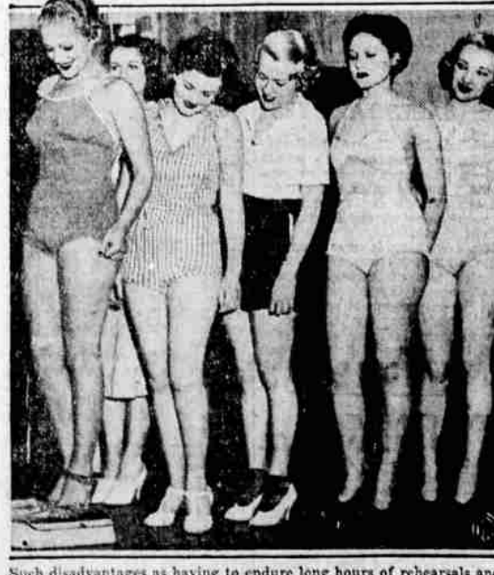
Such disadvantages as having to endure long hours of rehearsals and weigh in daily to avoid getting overweight are overcome for these chorines who migrated from the chill winds of Broadway to Miami, Fla., to play in the floor show of a night club there during the resort season.