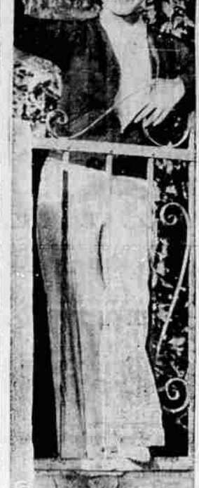
Marion Talley, a new film star in Hollywood—25 pounds lighter—is pictured as she hurried to a film studio in Hollywood recently. The noted opera star is preparing for her screen debut and while a story is being prepared, she is busy with costume and makeup tests. To fool the camera, which occasionally makes a subject look heavier, she shut herself in her room at mealtimes, subsisted on fruits, vegetables and fruit juices, to lose 25 unwanted pounds.

FAMILY REUNION IS ENJOYABLE AFFAIR OF CHRISTMAS DAY