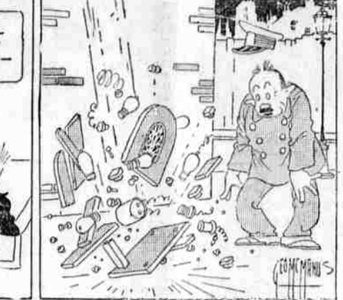
© 1931 East Feature Service, Inc. Great Britain rights reserved.