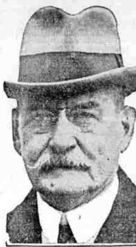
HUGH C. WALLACE

WASHINGTON, Jan. 1.—Hugh Campbell Wallace, 67, former ambassador to France, died today. He was a native of Tacoma, Wash.