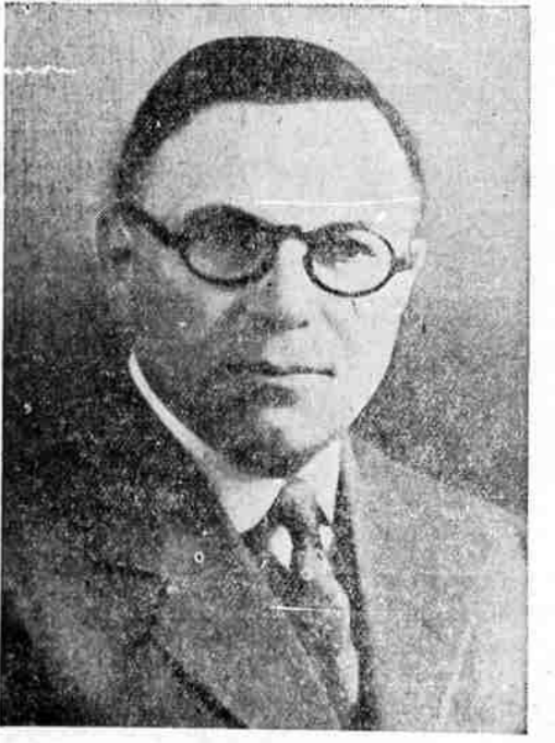
PHIL METSCHAN Republican Candidate for Governor

Thousands of children are thrown behind in their studies at the opening of every school term because their parents are unable to purchase books for them. This shameful condition is placing children of families of low incomes at a disadvantage and building up a class consciousness. Phil Metschan will lead a fight for free text books.