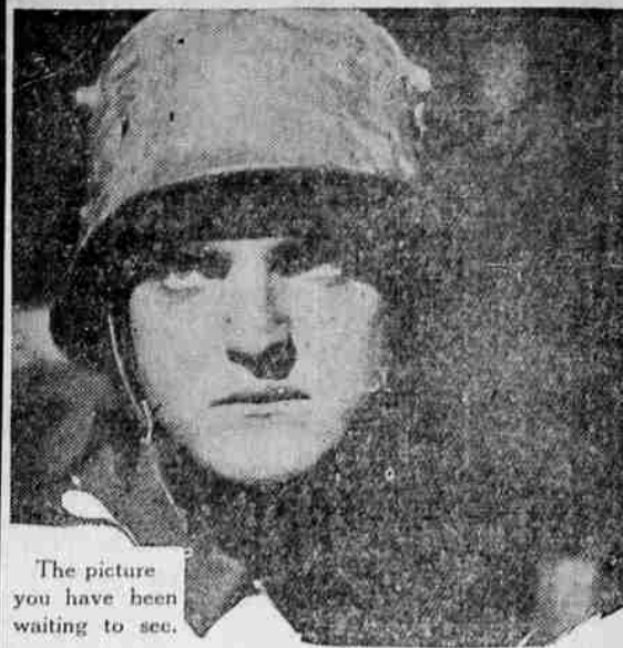
The picture you have been waiting to see.

Do Your Bit Toward Sending the Boys to Baker!