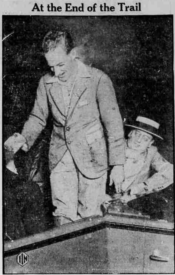
Major Charles Kingsford-Smith, famous aviator, stepping from the automobile that brought him to the plane the Southern Cross to the hangar at Roosevelt Field, L. I., where a wild crowd cheered him to the echo.