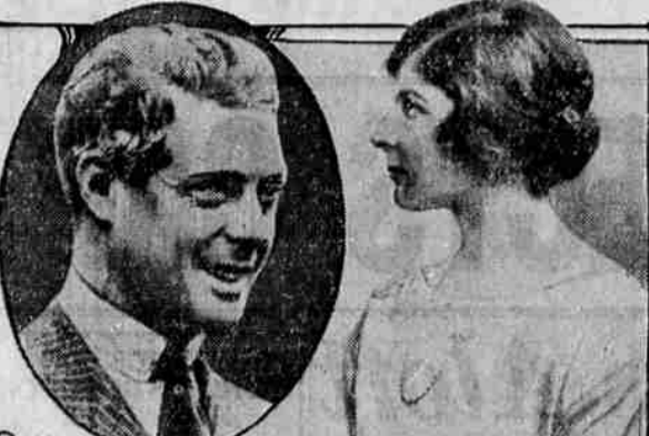
PRINCE OF WALES.

England's Popular Prince Seems Likely to Be Second Bachelor King Since 1760.