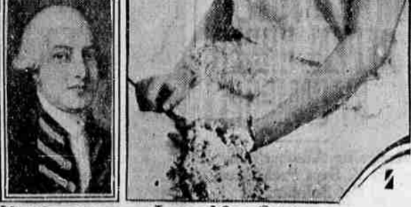
KING GEORGE II.