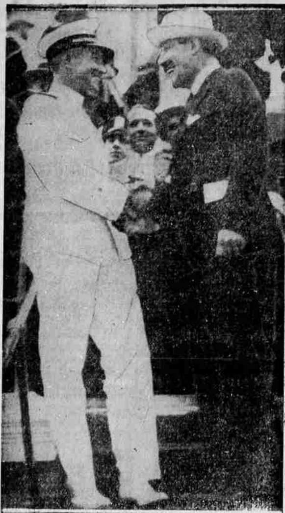
Telephoto shows former police commissioner of New York City welcoming Admiral Richard E. Byrd home from his Antarctic expedition aboard the Macon.