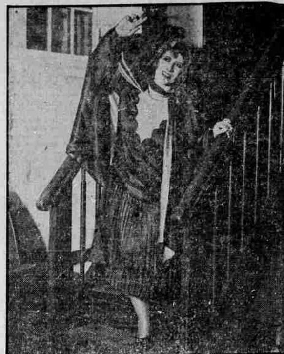
Mrs. Aimee Semple McPherson, noted Los Angeles, Cal., evangelist, looking as fashionable as ever as she arrives on the S. S. Europa after a tour of the Holy Land.