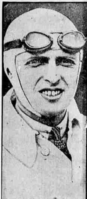
Major Sir Henry Seagrave, international automobile racer, was killed while testing a speedboat at Lake Windermere, England, where he was attempting to gain recognition for a pace of 109 miles an hour achieved during an unofficial run earlier in the week.