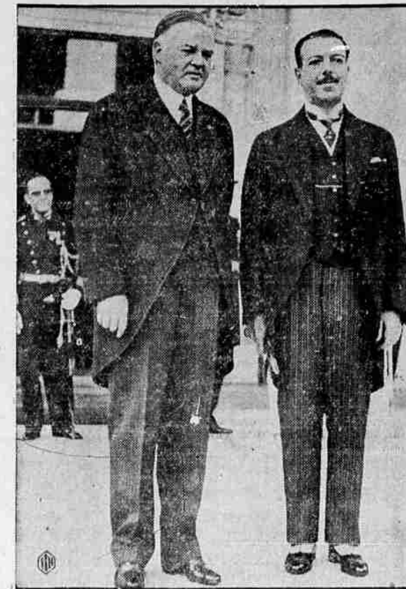
President-Elect of Brazil, Doctor Julio Prestes, with President Herbert Hoover at the White House, Washington, D. C., who, as President-elect, visited Brazil shortly before his inauguration. That good-will visit is returned in kind by this one. Many Pan-American diplomats attended the meeting.