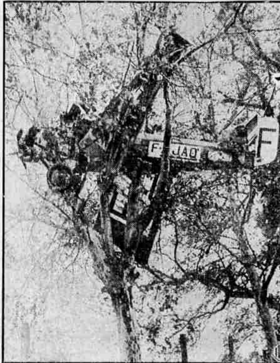
When this airplane crashed from a height of 117 feet recently at Chalon-Sur-Saone, France, it was miraculously caught in the branches of this tree. Neither the owner nor his guest was injured. Three more feet and the plane and occupants would have crashed into the river, which may be seen in the background.