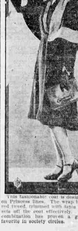
This fashionable coat is designed on Princess line. The waist is of red tweed, trimmed with lapin and sets off the coat effectively. The combination has proven a great favorite in society circles.