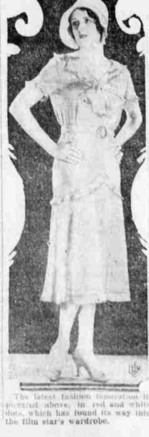
The latest fashion innovation in dress, which has found its way into the film star's wardrobe.