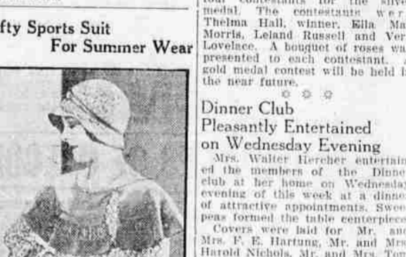
For wear during the summer when the sun's bright rays are striking everywhere, a stunning suit of green and white sports flannel, coat and dress of challis, with a hat of challis to match the dress.